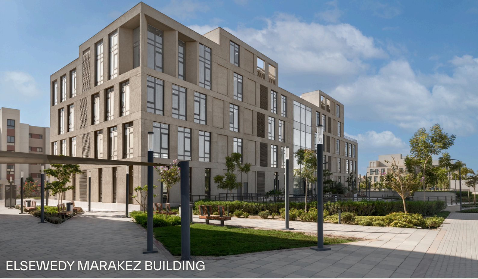
ELSEWEDY MARAKEZ BUILDING